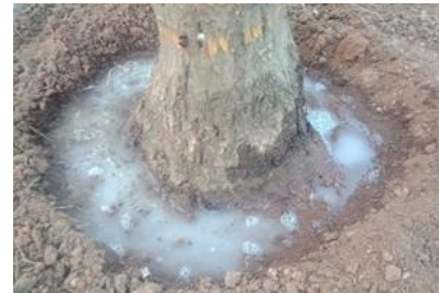
Application of paclobutrazol