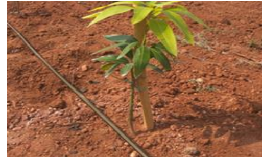
Precise irrigation and nutrient management