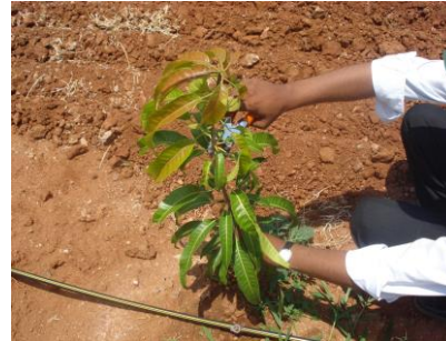
Training of young trees