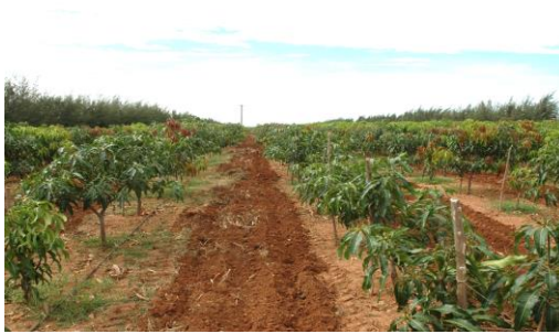
>500 plants per acre and rectangular planting