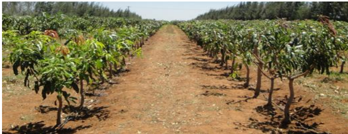
Pruning of trees after harvest