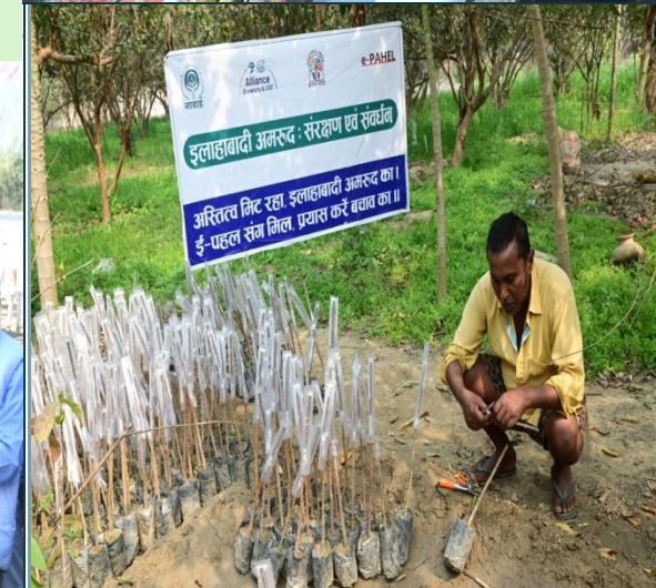
Grafting and Community Nursery