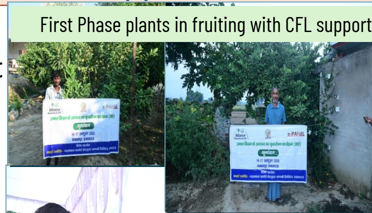
First Phase plants in fruiting with CFL support