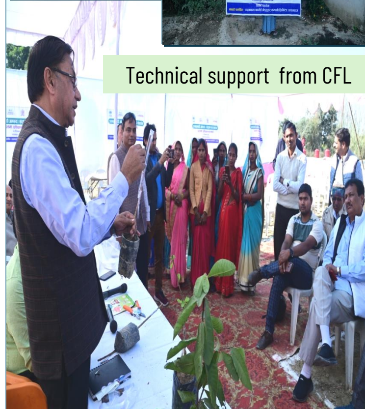
Technical support from CFL